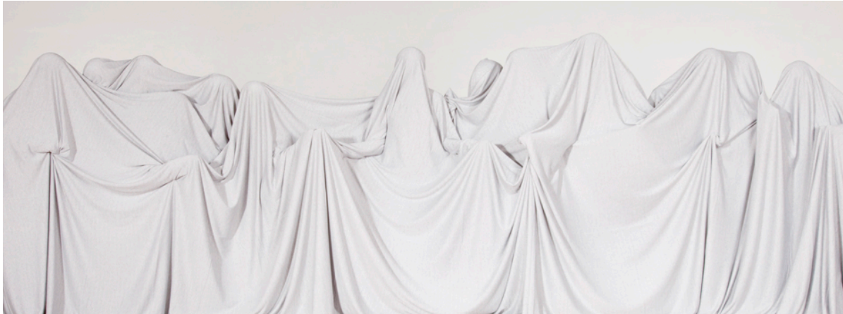
Syagini Ratnawulan L.S. 2011 photograph 57.2 x 150.3 cm

Indonesia, Singapore, India, Afghanistan, Brazil, Argentina and the United States – Various homes to various artists who return to Japan to create a place for co-existence at the Hara Museum.