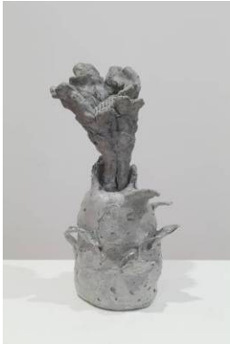
Erika Verzutti Carbonada 2010 concrete, glass beads 32 x 13 x 13 cm