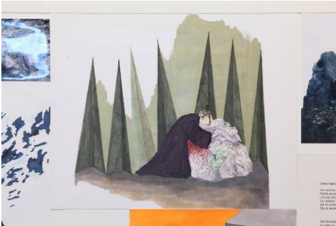
Florencia Rodriguez Giles Fictional Islands 2009 pencil, marker-pen, watercolor, paper, photograph prints 100 x 100 cm (Installation size) (partial view, reference image)