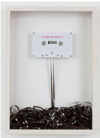
Duto Hardono Untitled (You Chose the Wrong Side) 2011 framed hand stamped cassette tape 36.0 x 21.2 cm (reference image)