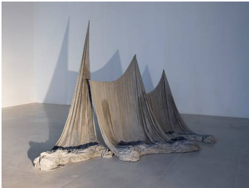
Thiago Rocha Pitta Monument to the Continental Drift 2012 cement on canvas 170 x 250 x 100 cm (reference image)