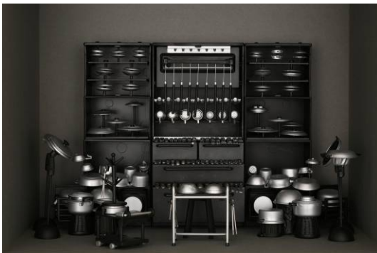
Donna Ong In the Secret, in the Quiet Place (v) 2008 enamel paint, miniature plastic toys, miscellaneous plastic items 44 x 37 cm