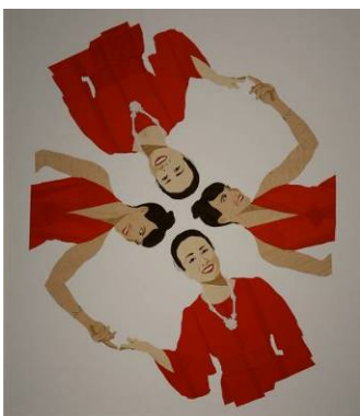
Mary Elizabeth Yarbrough Oh-me nee kakatte ureh-shee des! (I am glad that I meet you!) 2007 duct tape and contact paper on contact paper 63 x 56 cm