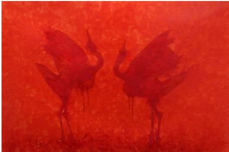
Pradeep Mishra warmthoftogetherness 2010 oil paint, paper 138 x 209 cm