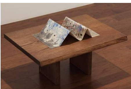
Minam Apang Hillside Stories: Neli and Yomi 2009 cotton thread, synthetic glue, 400 gsm fabriano cold press archival paper, ash wood table 26 x 56 x 8.5cm (paper work); 35 x 70 x 35cm (table)